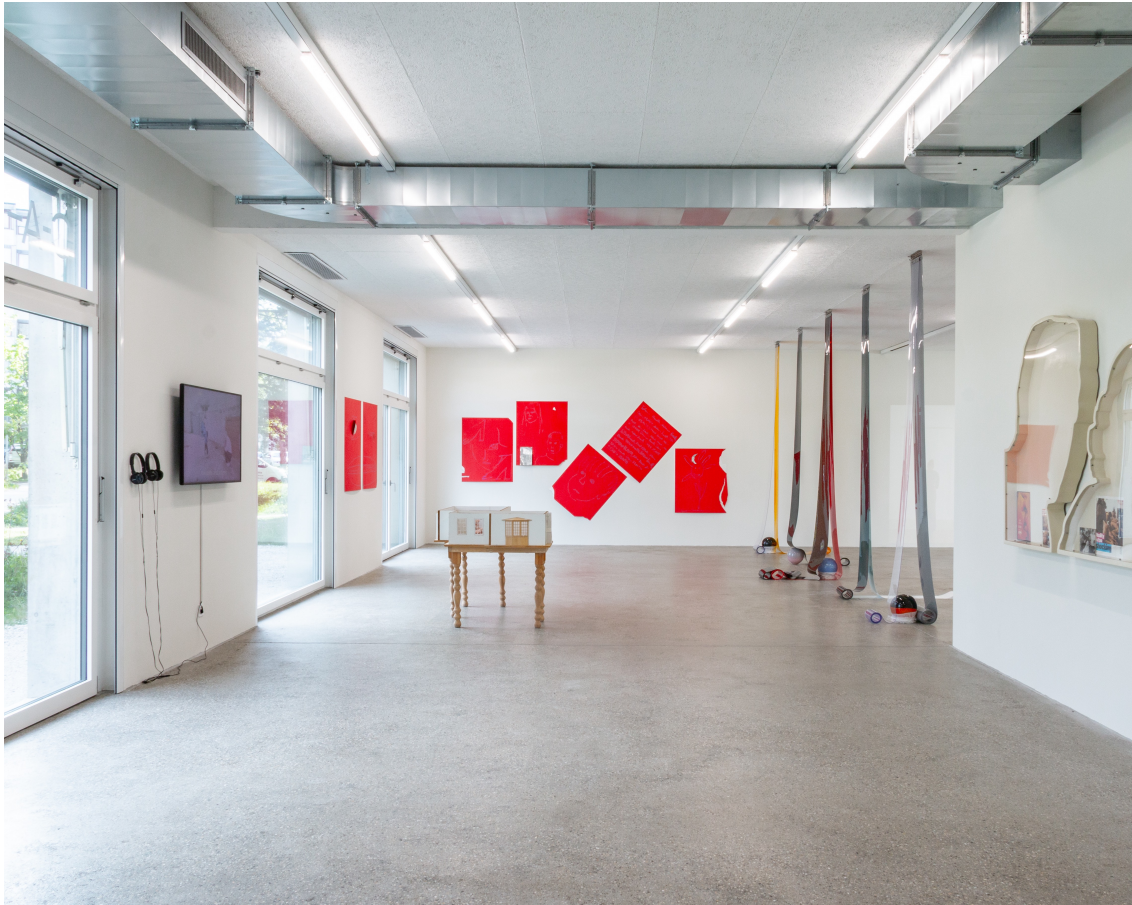
Exhibition view "Our Labor, Our Passion, Our Love", CALM - Centre d'Art La Meute, Lausanne, Switzerland, 2024