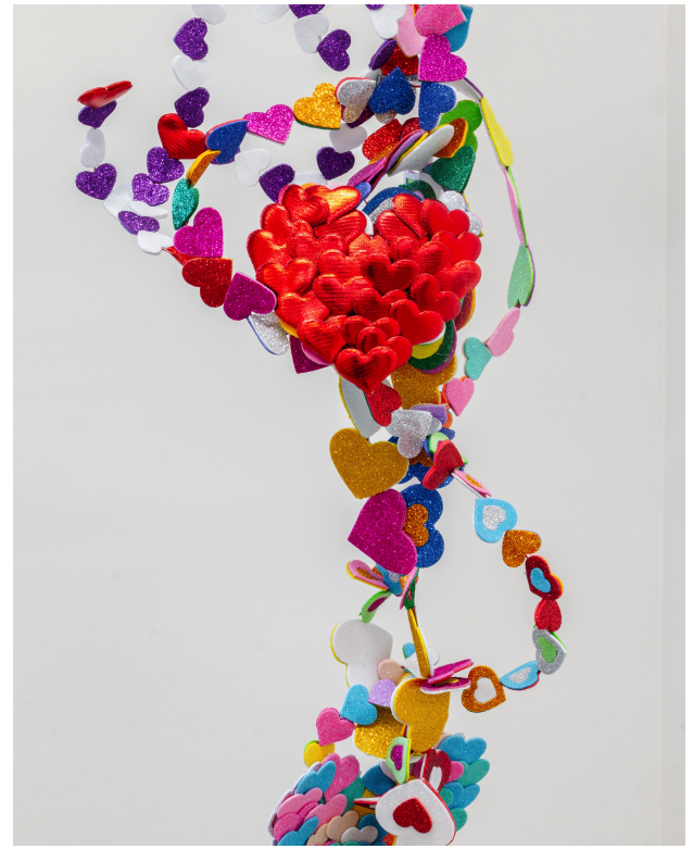
Exhibition view "Our Labor, Our Passion, Our Love"; Marisabel Arias, I am only for you , 2024, 240x30x15cm; I am only for you love , 2024, sponge hearts, microporous glitter, aluminum hook, 25x37x10cm, CALM - Centre d'Art La Meute, Lausanne, Switzerland, 2024