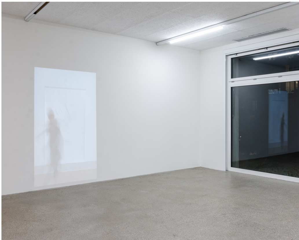
Exhibition view "Our Labor, Our Passion, Our Love"; D. Denenge Duyst-Akpem, Rope Beating Drawing, Pastoral Brutalism series , 2022, private performance video, artist's body/gesture, rope, charcoal and paper, CALM - Centre d'Art La Meute, Lausanne, Switzerland, 2024