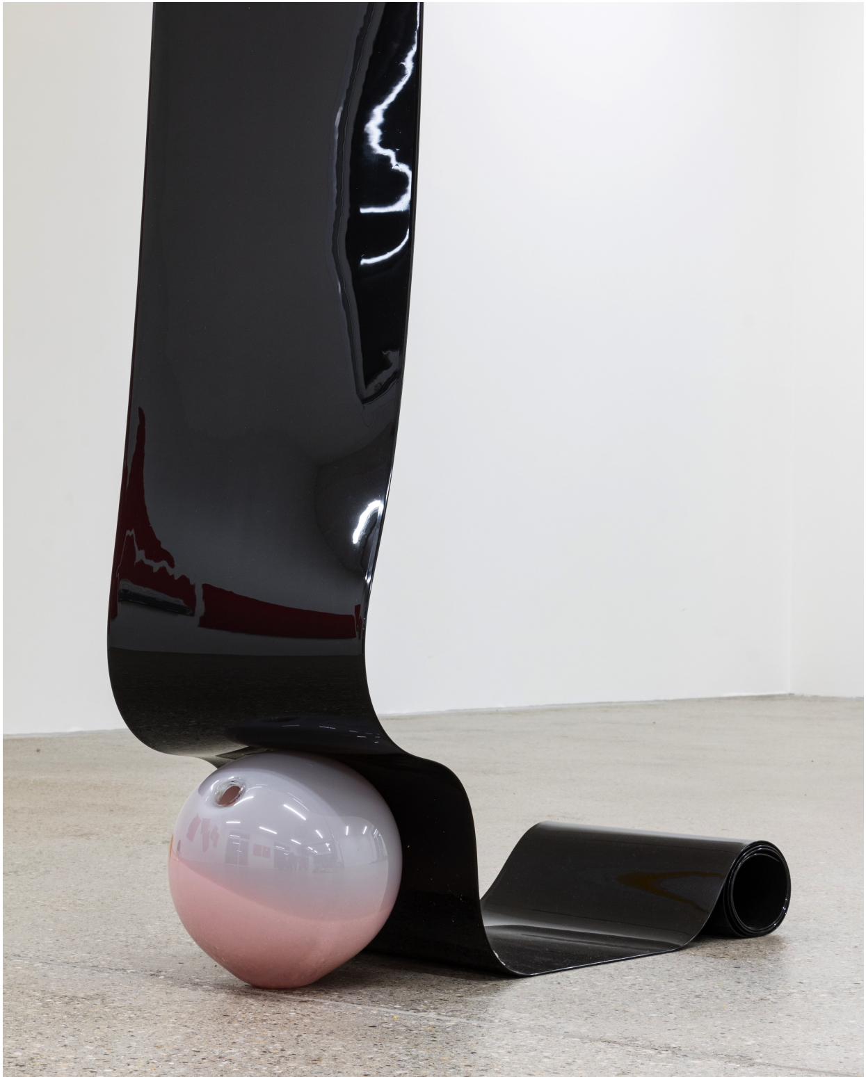
Exhibition view "Our Labor, Our Passion, Our Love"; Charly Mirambeau, Private Pursuits and Public Problems (Conditions of Possibility) , 2024, stainless steel rail, PVC, glass, CALM - Centre d'Art La Meute, Lausanne, Switzerland, 2024 / Photo: Théo Dufloo / Courtesy of the artist and CALM - Centre d'Art La Meute.