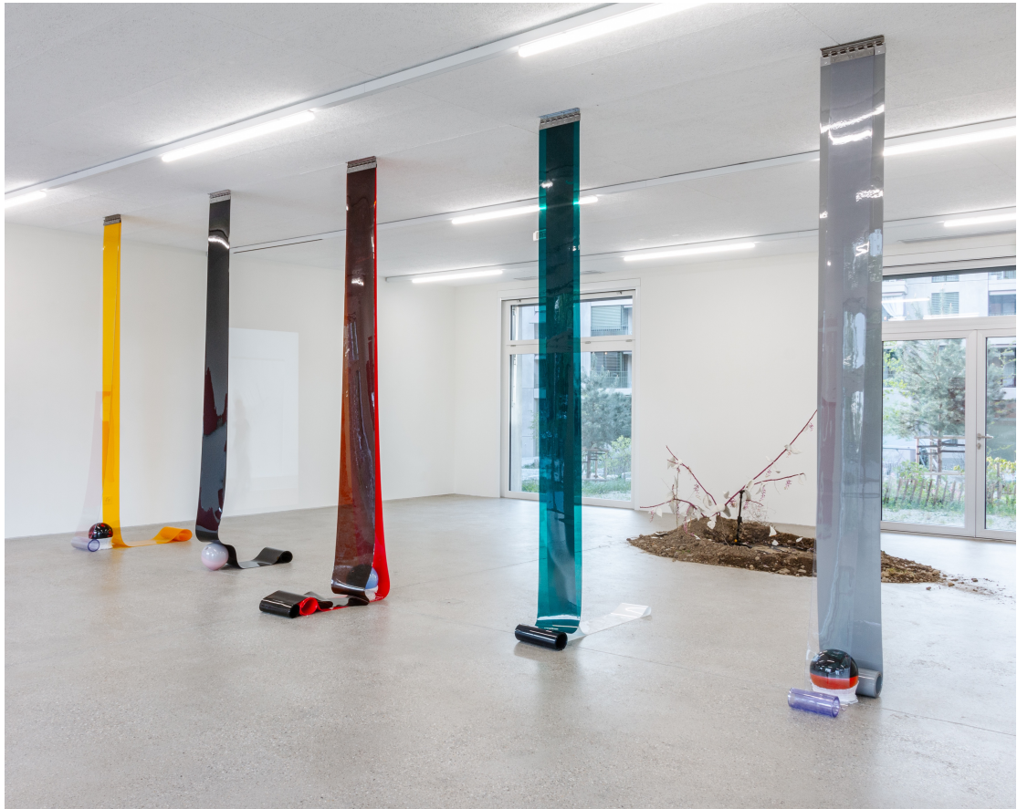
Exhibition view “Our Labor, Our Passion, Our Love”; Charly Mirambeau, Private Pursuits and Public Problems , 2024, stainless steel rail, PVC, glass, fabric (five elements), CALM - Centre d'Art La Meute, Lausanne, Switzerland, 2024