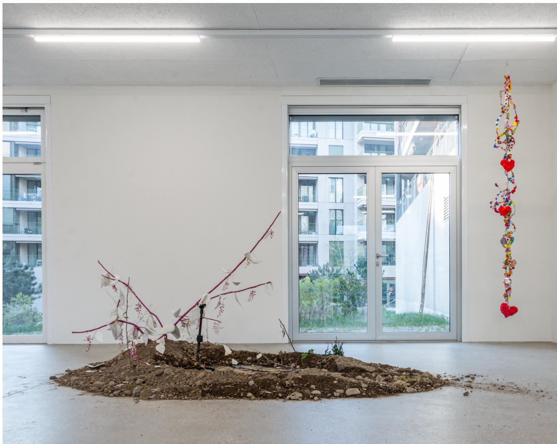
Exhibition view “Our Labor, Our Passion, Our Love”; Juri Bizzotto, Phytolacca Vol. 1 , 2024, installation and performance, branches, beads, fabric, microphone, dim. variable, CALM - Centre d'Art La Meute, Lausanne, Switzerland, 2024 / Photo: Théo Dufloo / Courtesy of the artist and CALM - Centre d'Art La Meute.